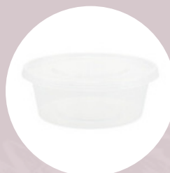
Disposable container Link